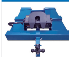
5th Wheel Hitch