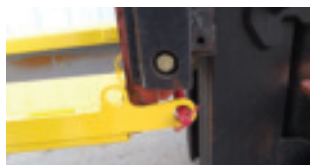
Heavy Duty- Made from High Strength Steel. 20+ sizes.