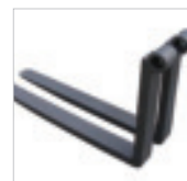
Specialized forks for heavy equipment