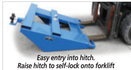
Easy entry into hitch. Raise hitch to self-lock onto forklift