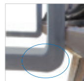
"Optimal Heel" for added strength and wear resistance